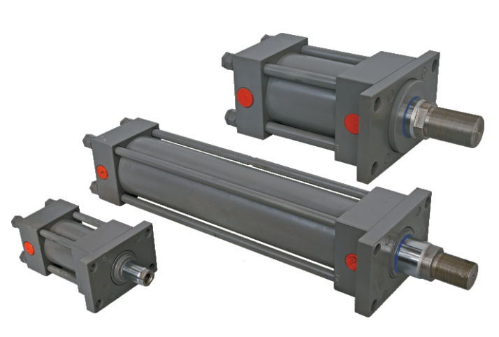
Low Pressure, Rectangular Flange Mounting